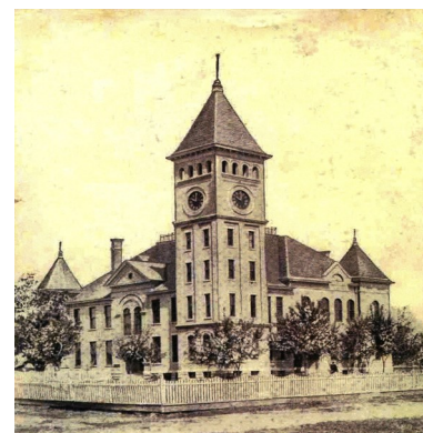
The above photo is of the Saline County courthouse in 1906.