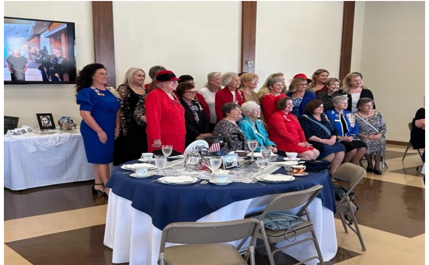
Congratulations to the Provincia de la sal, Daughters of the American Revolution on their 70th Anniversary