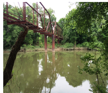
Old Saline River Bridge 2016

This should be an interesting presentation and we think you will enjoy it. Circle the date on your calendar and bring a friend to the meeting.