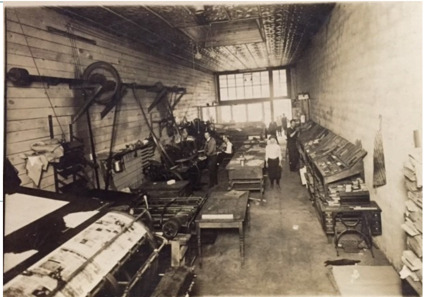
Benton Courier Office c. 1911