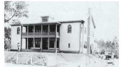
Construction of the Bauxite Community Hall in 1926

Please make your plans to attend the July meeting of the Saline County History & Heritage Society on Thursday, July 19th at 6:00 pm at the Bauxite Museum. Do not come to the historical society, please meet at the Bauxite Museum in Bauxite.