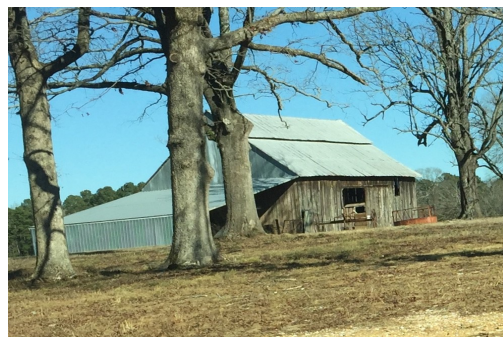
Prange Barn Avilla