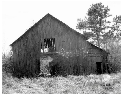
Will Green Barn Sardis

We hope you will attend the May program on May 17 to see the program on Saline County Bridges.