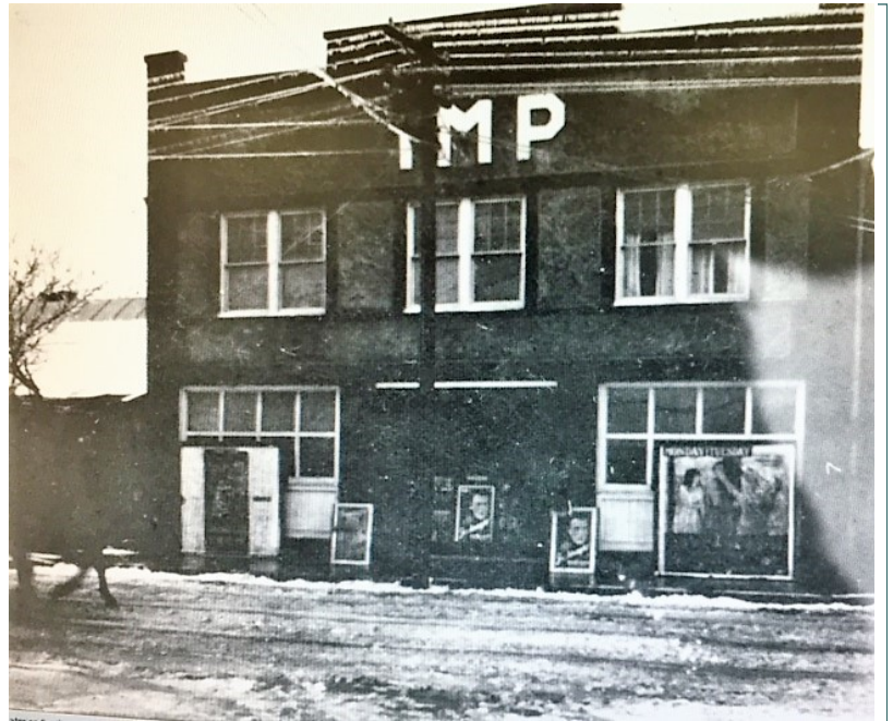
IMP Theater c. 1925