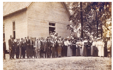
Tull Old Folks Singing 1913.