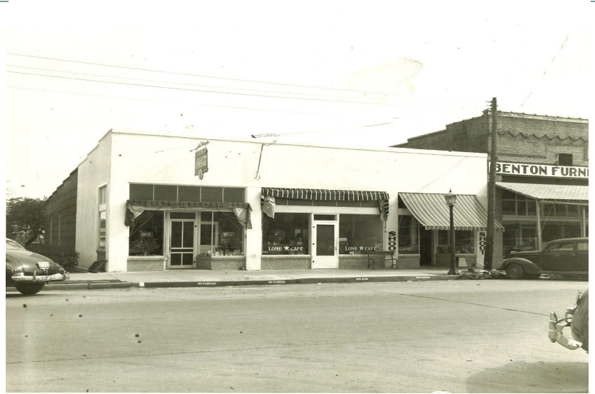
Benton Lone Star Café on Main Street c. 1940

The Lone Star Café was one of many of the eating establishments available in downtown Benton in the 1930's, 1940's, and 1950's.