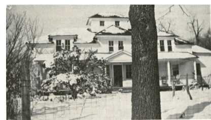
The William and Alwina Lenz Home on Highway 5 is now owned by Oscar Lenz.

The group was formed in early January and is now raising funds to preserve the house. This is one of the oldest structures in Saline County and is located on the old Military Road, one of the oldest roads in the nation. Make plans now to attend this meeting.