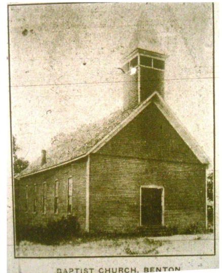
BAPTIST CHURCH, BENTON