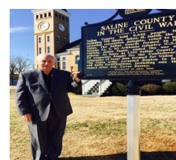
Civil War Marker Erected