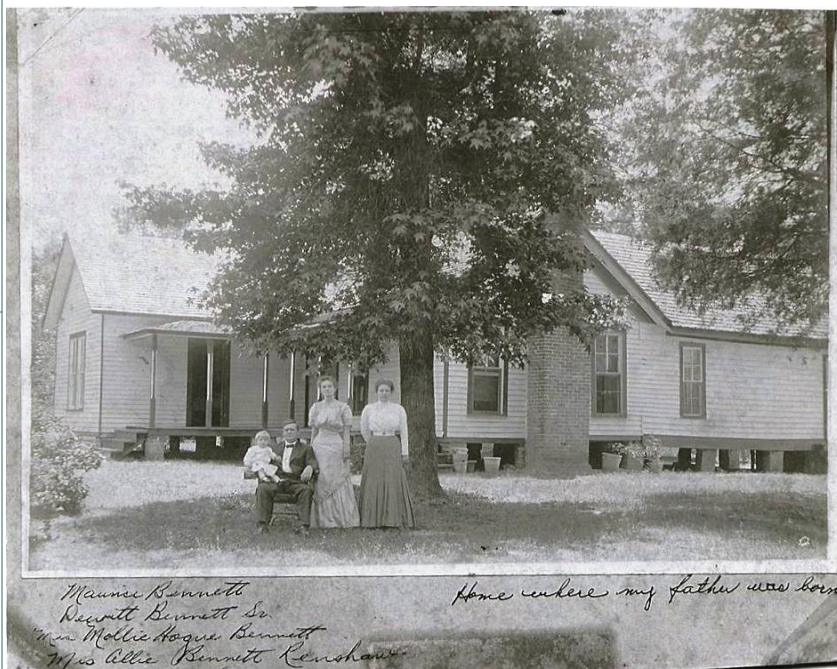
Dewitt Bennett home was located just off of Highway 35 where Bennett Road is today.

This section of the newsletter will feature photos of places and families in Saline County, Arkansas.