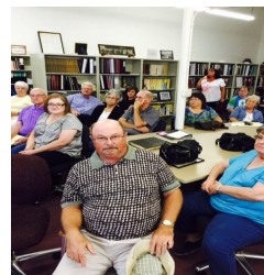
Large Crowds in 2015