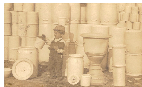
A photo of early Bennett pottery.