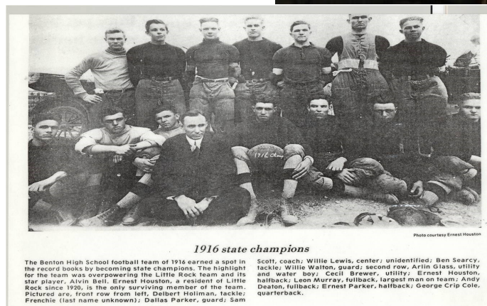
1916 state champions