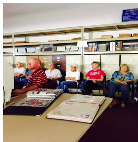
Scrapbooks of memories of the area were on display at the meeting.