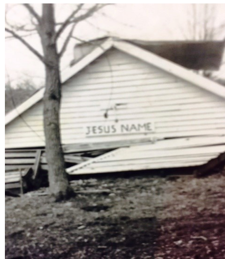
Jesus Name Pentecostal Church after the tornado.