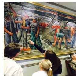
2015 Walking Tour