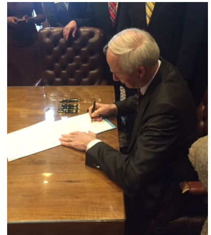
Governor signs bill March 7th