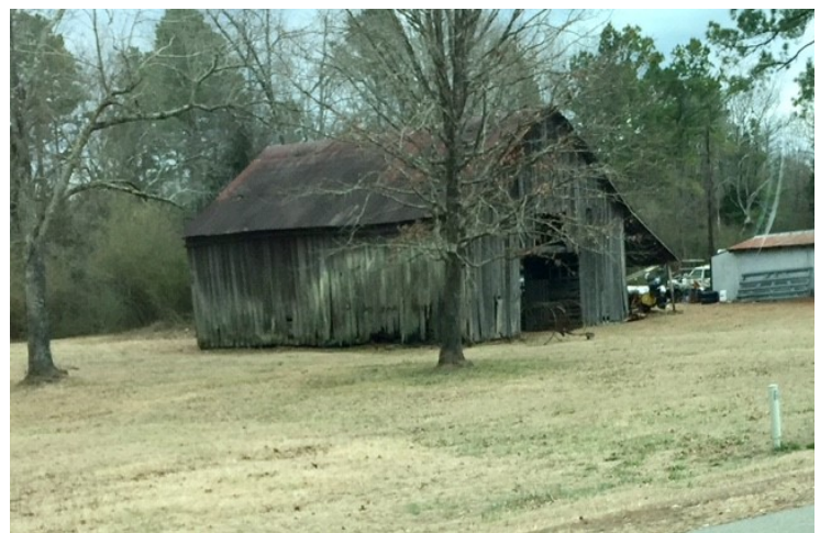
DuVall Barn, Tull, Arkansas